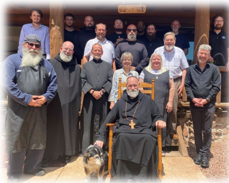
The 2023 Oblate Retreat with Monks & Interns